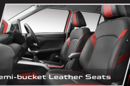
Semi-bucket Leather Seats