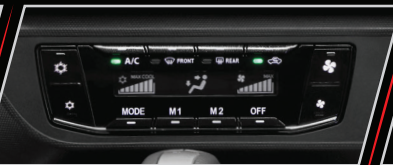
Digital Air Conditioner Controller with Quick OFF Button