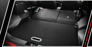
Full-flat Mode Rear Seats