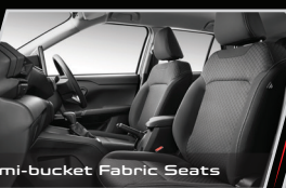
Semi-bucket Fabric Seats