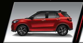
Pearl Delima Red*