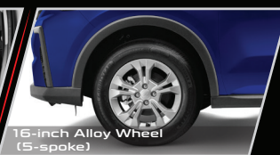
16-inch Alloy Wheel (5-spoke)