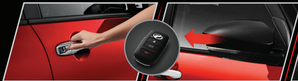
Electrostatic Switch Door Handle

Greater visibility of the front, side and rear.