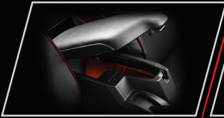
Console Box with Padded Armrest*