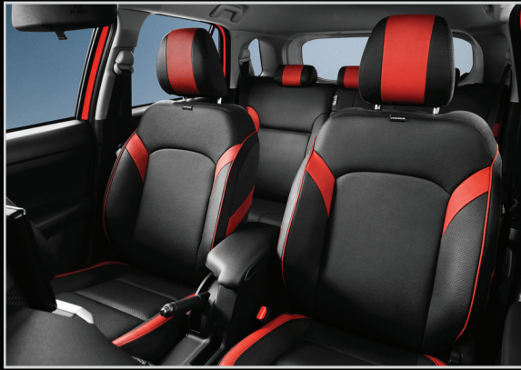
Spacious Interior for a Comfortable Ride

Ergonomically designed to accommodate diverse requirements and needs.