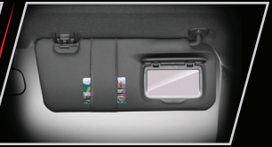
Vanity Mirror with Card Slot