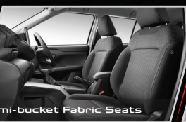
Semi-bucket Fabric Seats