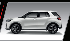
Pearl Diamond White**