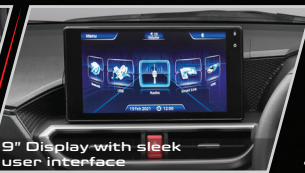
9" Display with sleek user interface