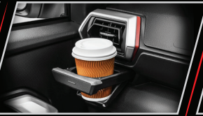
Built-in Cup Holder