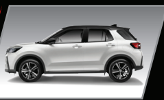
Pearl Diamond White*