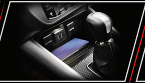
Open Tray with Illumination