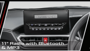
11" Radio with Bluetooth & MP3