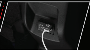
Rear USB Ports*