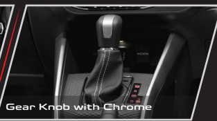
Gear Knob with Chrome