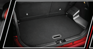
Tier 1: 303 litres