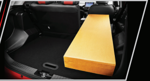
60:40 Split-folding Rear Seats