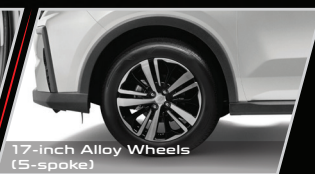
17-inch Alloy Wheels (5-spoke)