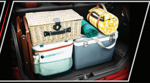
Tier 2: 369 litres