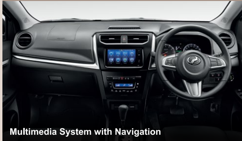
Multimedia System with Navigation