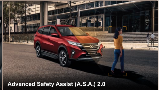
Advanced Safety Assist (A.S.A.) 2.0