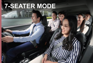
When you just need 2 more.