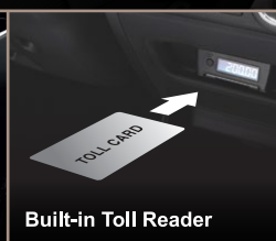
Built-in Toll Reader