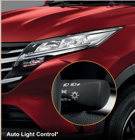
Auto Light Control*