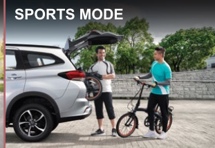
Pack it all in for weekend adventures.