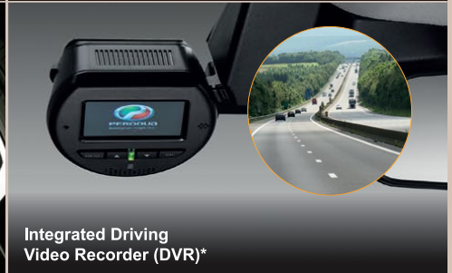
Integrated Driving Video Recorder (DVR)*