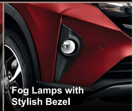
Fog Lamps with Stylish Bezel