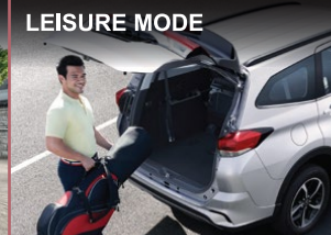
Load it up and pack it in.