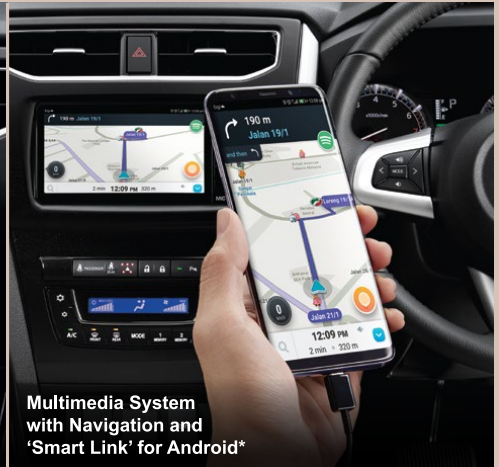
Multimedia System with Navigation and 'Smart Link' for Android*