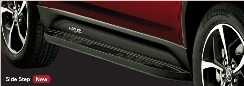
Side Step New