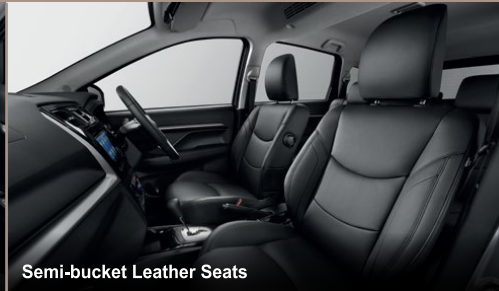
Semi-bucket Leather Seats