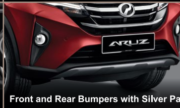
Front and Rear Bumpers with Silver Painted Diffuser