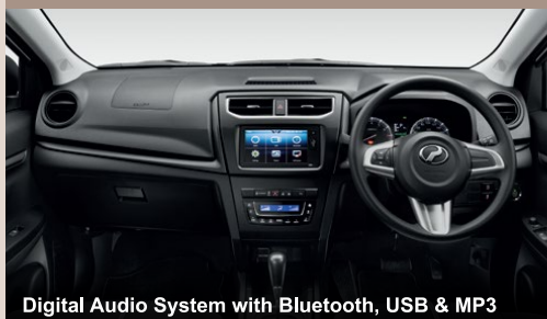
Digital Audio System with Bluetooth, USB & MP3