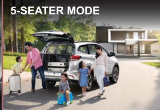
Road trips are always better with your loved ones.