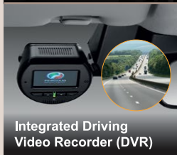
Integrated Driving Video Recorder (DVR)