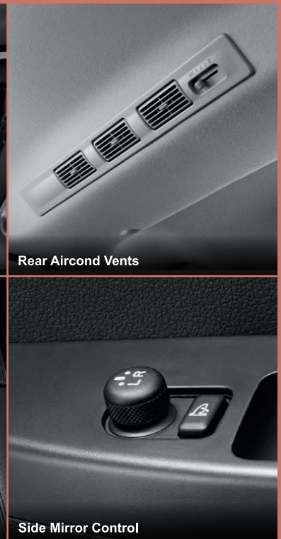
Rear Aircond Vents