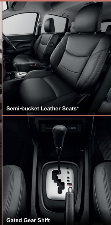
Semi-bucket Leather Seats*