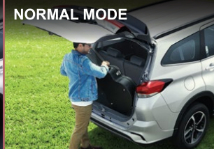
More room for more stuff.