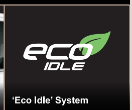
'Eco Idle' System