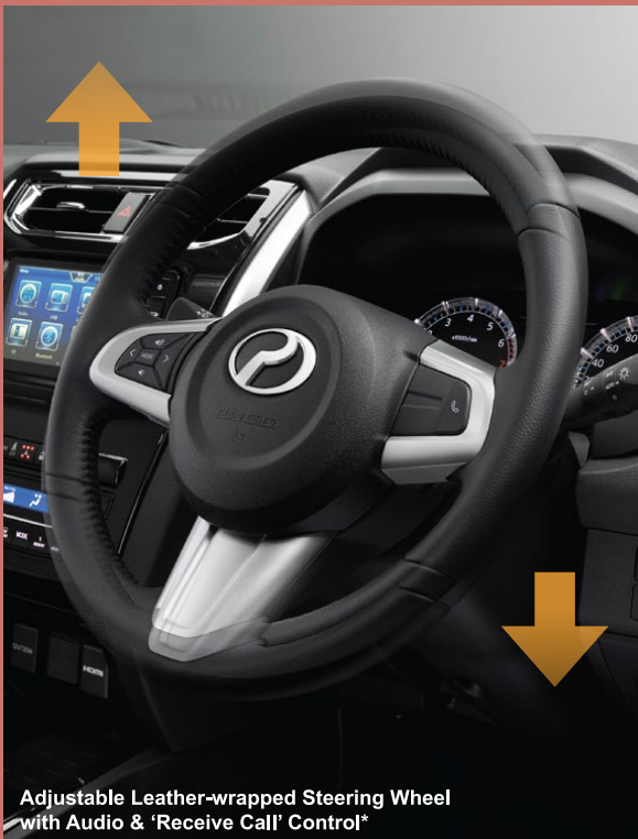
Adjustable Leather-wrapped Steering Wheel with Audio & 'Receive Call' Control*